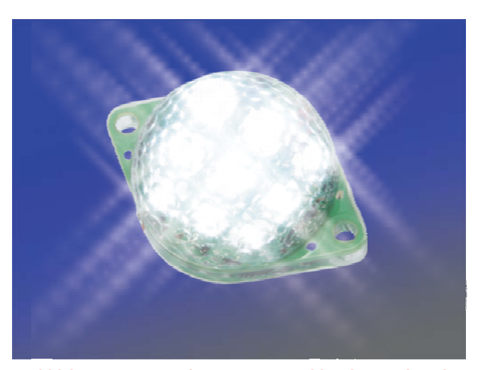
5.000 hours or max. 3 years assured luminous duration Made in Germany